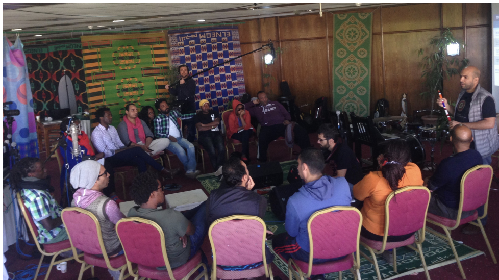
Figure 2: Dialogue session at the 2016 Gathering in Aswan, Egypt. A talking stick is used in effort to ensure that only one person is talking at a time and that all are focusing on the speaker.

The Nile Project’s mission is to spur curiosity and encourage discourse, learning, and understanding in an effort to find an innovative and alternative solution to the water crisis in the Nile Basin region. Their aim is to “transform the Nile conflict by inspiring, educating, and empowering an international network of university students to cultivate the sustainability of their ecosystem. The project’s model integrates programs in music, education, dialogue (see Figure 2 ), leadership, and innovation to engage students across disciplines and geographies” ( http://nileproject.org/ ). It seeks