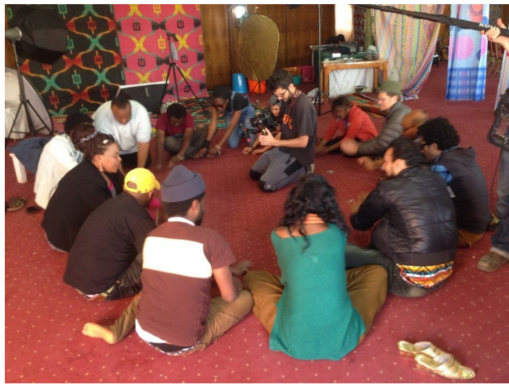
Figure 1: Musicians play the stone passing game from Ghana at the 2016 Gathering in Aswan, Egypt. Learning to work as a group to accomplish a task.

How can your community grow? I think that is a lot of the process that we’ve experienced. The grown sense of we and beyond that. The fact that when it comes to growing that musically. It is love; the collectiveness that we are reaching towards. Personally, that’s an on-going journey. The people on stage truly love each other – that kind of feeling of the cross-cultural experience. (Meklit Hadero, observation, March 30, 2015) 2